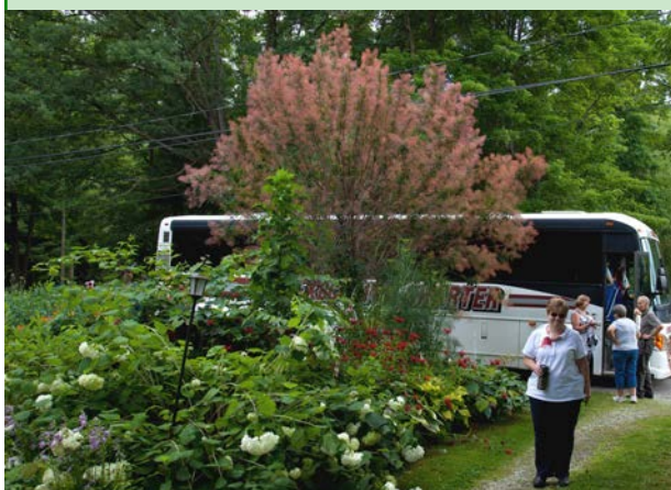
(Left) 2016 Bus Trip

Join the Great Lakes Region Hosta Tailg8 and enjoy several residential gardens, unique nurseries, etc. The Southwest Michigan Hosta Society is hosting. Register no later than June 2 for this fun trip. Space is limited. See yearbook for registration form, cost, and additional information. Don't miss out!