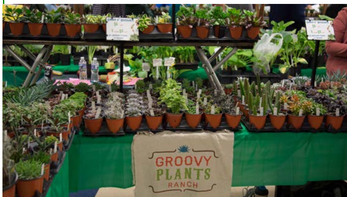
Photo taken at the 2017 Hosta College

Wengerlawn Nursery Co. wengerlawnnursery.com 6450 Wengerlawn Rd, Brookville, OH 45309 (937)884-7692