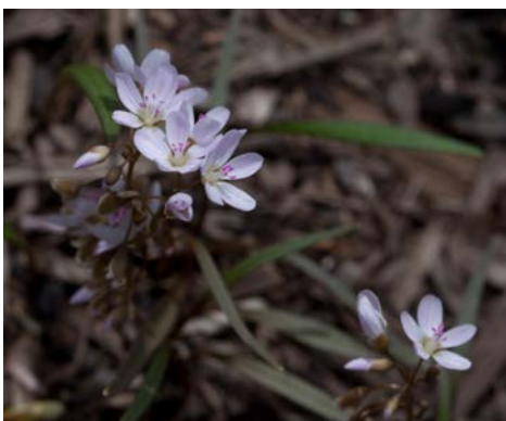
A Tale of Two Springs Claytonia virginica (Spring Beauty)