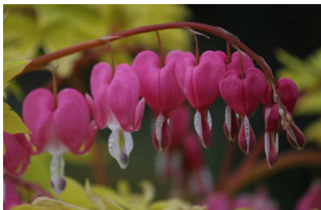
Dicentra spectabilis 'Gold Heart'