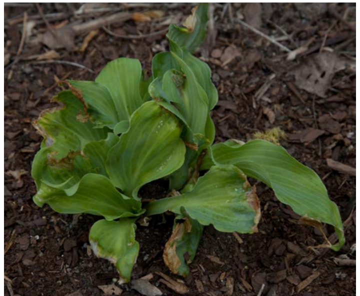
H. Joy Ride April 26, 2016 after a frost

Clarence Falstad III is involved in licensing and protection of intellectual property at Walters Gardens, Zeeland, MI. Used with permission.