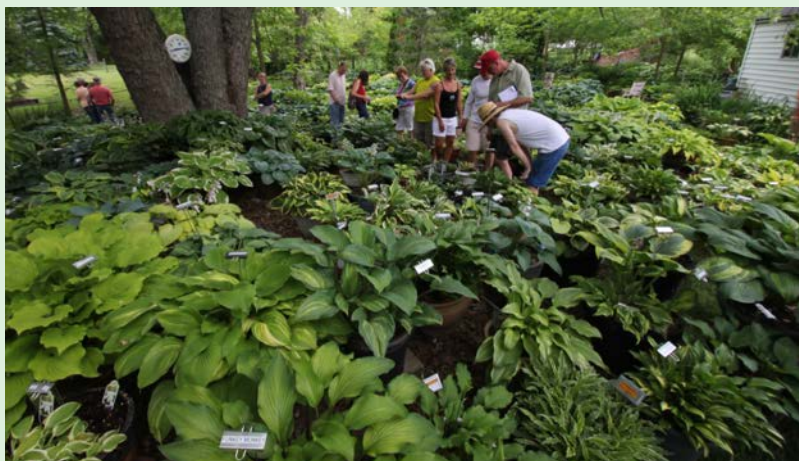
Photo taken during the Cincinnati Hosta Tour 2013 at Carlon Addison's Garden