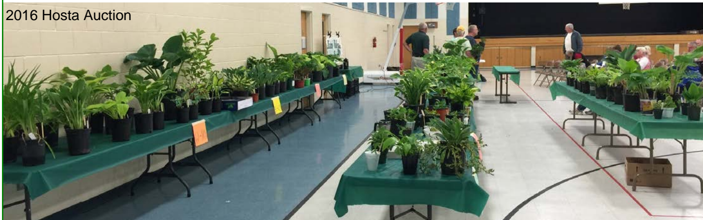
2016 Hosta Auction