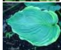
From Hosta Library H. Roller Coaster

Names of Hostas that are also Rides at Cedar Point.