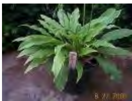
H. 'Roller Coaster Ride'