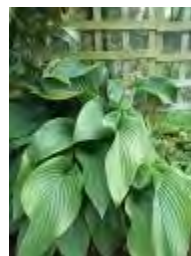
H. 'Gate Keeper'