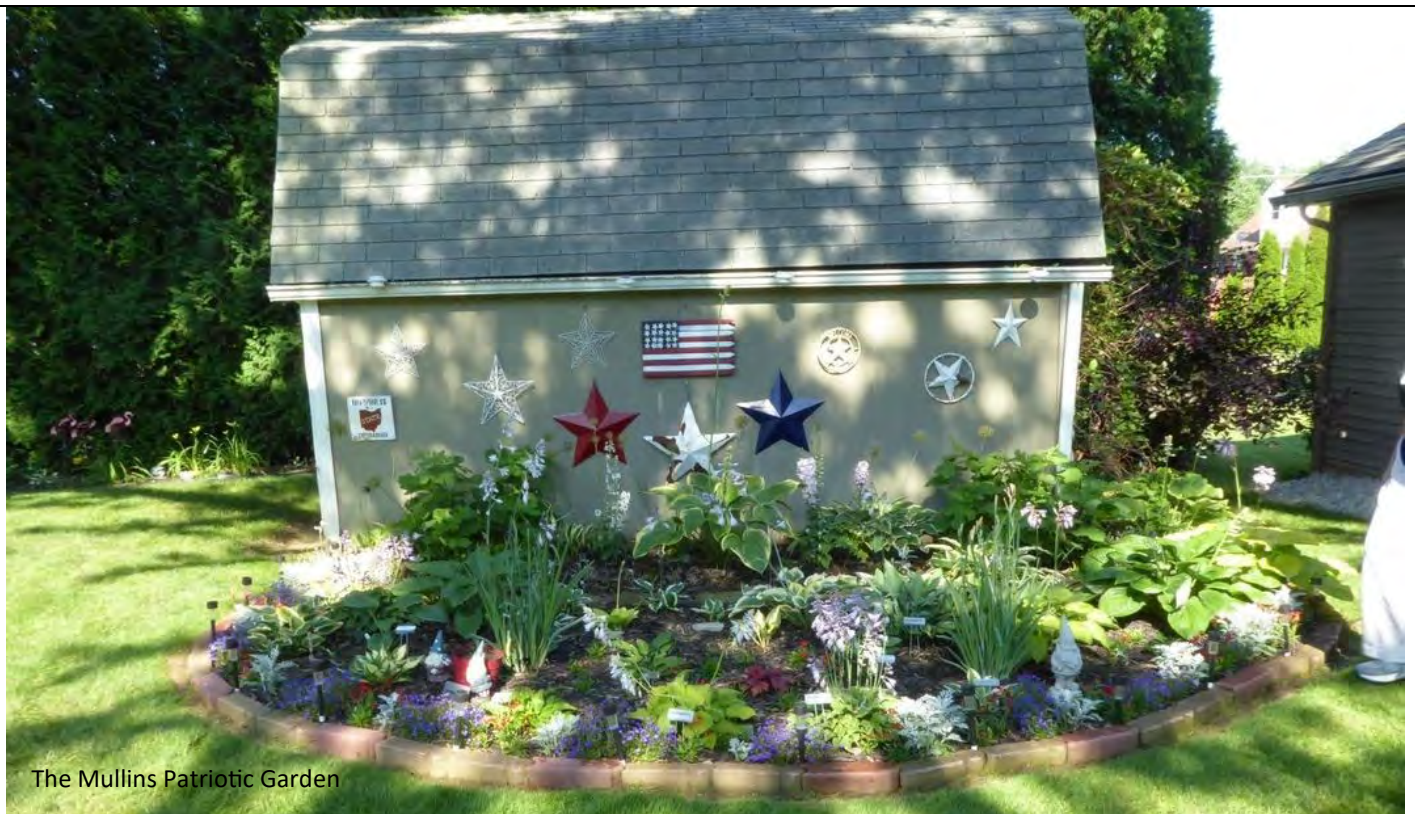
The Mullins Patriotic Garden