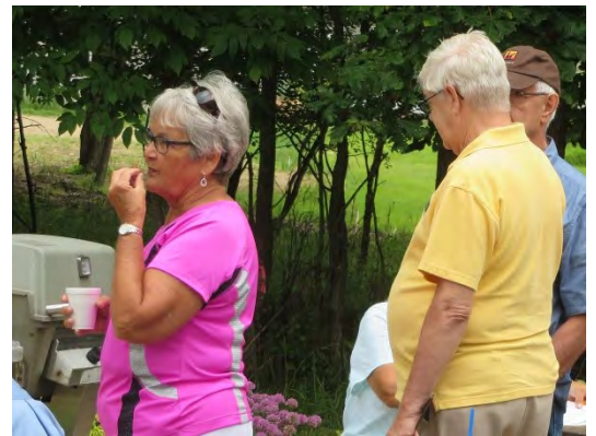
More pictures on the website.