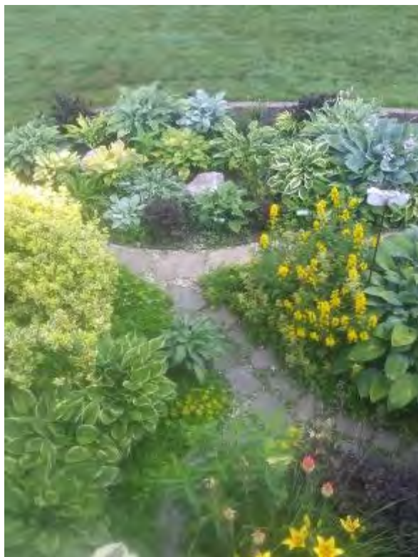
Left, view from the deck.