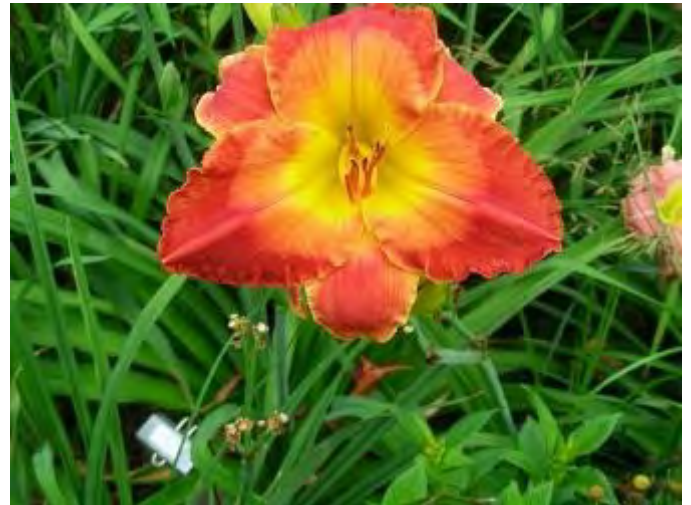
Right: Hermocallis 'Sierra del Rojo'