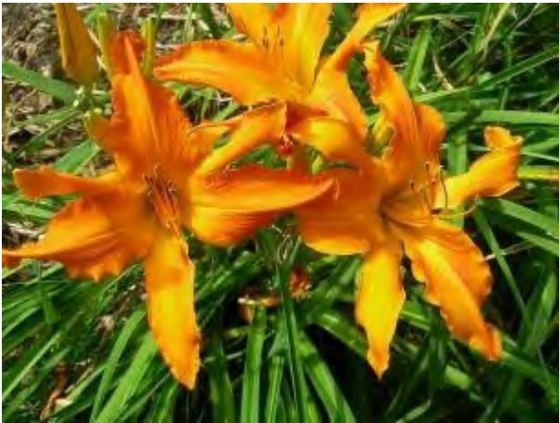
Left: Hermocallis 'Heavenly Dragon Fire'