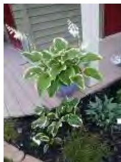
H. “American Hero’ below