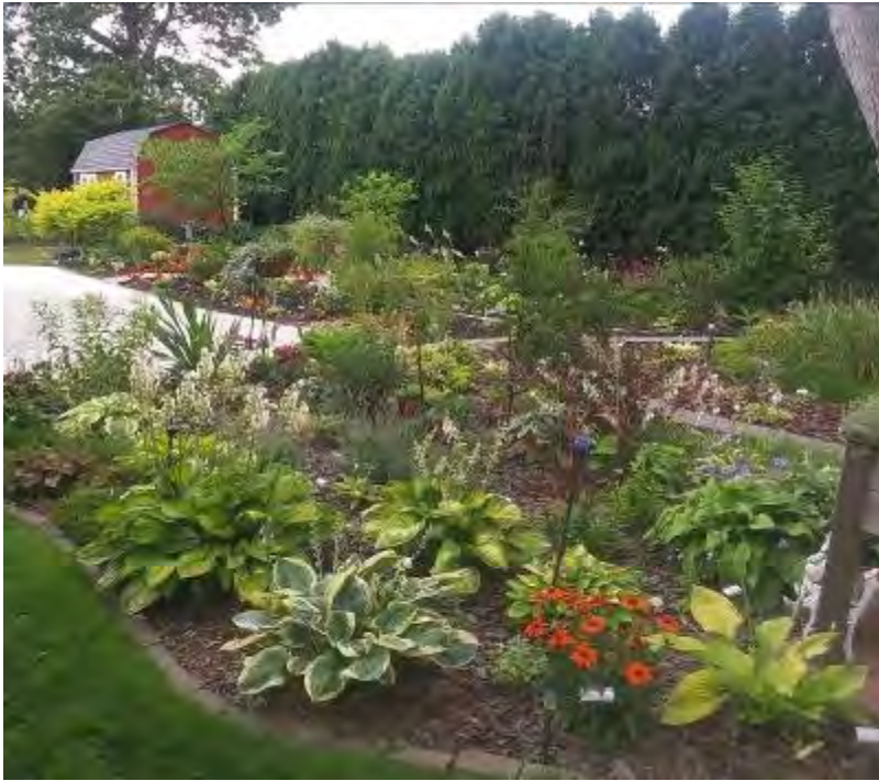
Two Year Old Garden

“Over the eight years, Andy and Denise Mullins have been transforming their small grassed property into a setting that reflects their personalities and interests. These include an environmentally-friendly culvert of hosta, lilies and sedum; a gnome-infested front garden; a patriotic Hosta bed; a pollinator section; and, a whimsical ‘Alice in Wonderland’ area. With emphasis on utilizing stressed or clearance plants, estate sale finds and landscaping materials from stores all over northeast Ohio, they hope visitors find as much enjoyment and surprises among the beds as they had creating them.”