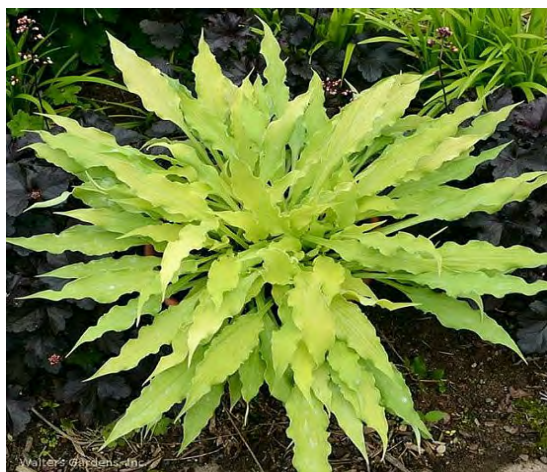
H. 'Wiggles and Squiggles'

2019 Hosta College Souvenir Plants (One per registered attendee)