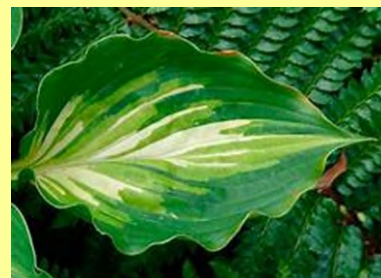
Hosta 'Lakeside Paisley Print'

Just to remind you of those changes, we are adding a new special section to include only the Hosta of Year of the Year (HOTY) exhibitions. In case you don't know, these plants are selected annually by the American Hosta Growers' Association based on such criteria as ease of growth, affordability and widespread availability. The 2019 HOTY is 'Lakeside Paisley Print,'