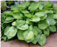
H. 'On the Edge'