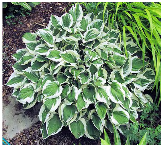
H. 'Diamonds are Forever'

Registration opens for Great Lakes Region Hosta Society Members: January 26 for only $42